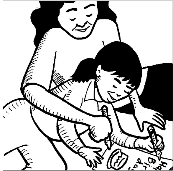
A gift card is a promise to do something with someone later.

The two of you will make a gift card for a special person. Explain that this card is a promise to do something with the person later. Have your child think of a friend or family member to give a gift card to.