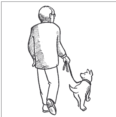
Think about chores a person might like help with.

Choice A: Talk with your child about what the special person likes to do for fun. Ask if your child would like to do any of these fun activities with the person later. Examples: